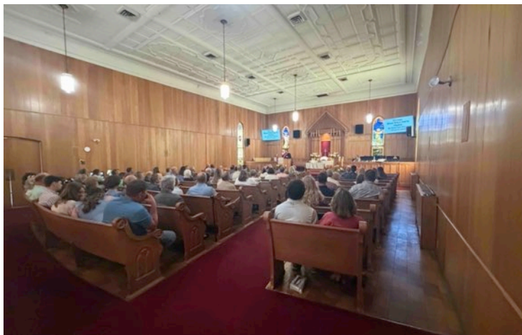
Bethesda had a full house on Easter Sunday. Christ is Risen, Indeed! Alluehuia!

You Will Hear the Trumpet Sound to Wake the Nations Underground!